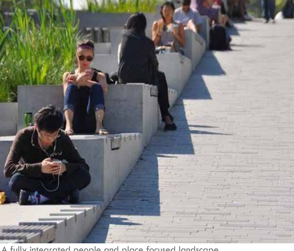
A fully integrated people and place focused landscape