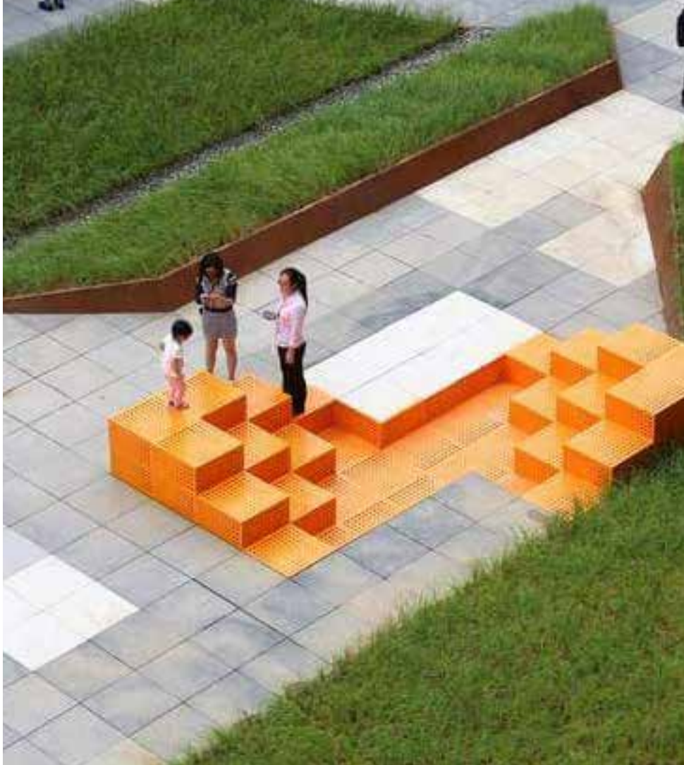
Integrated and interactive landscape